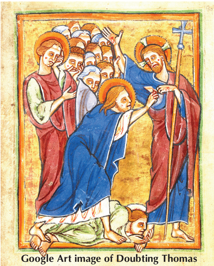
Google Art image of Doubting Thomas