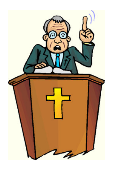
The Perfect Pastor

The perfect pastor preaches exactly 10 minutes.